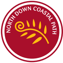
Medium Distance an additional disc should be used